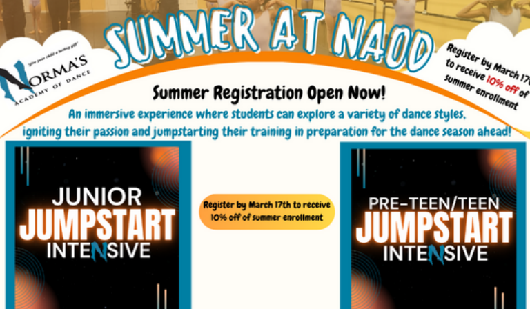
Ballet, Jazz, Contemporary, Hip Hop, & More

*Register by March 17th to receive 10% off of summer enrollment